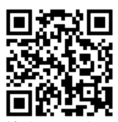
*If in the Yo-Se-Mite Chapter, scan the QR code above to check out their new website!