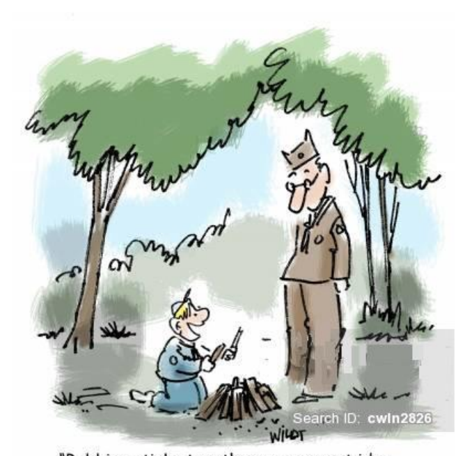
"Rubbing sticks together was a great idea. After 40 minutes, I'm so warm I don't need a fire!"